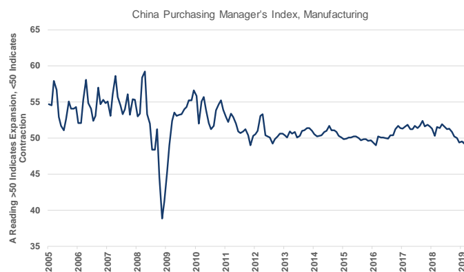
Exhibit 2: China’s economy was hit hard by the virus in February. Other countries will likely show weakness in March and April.