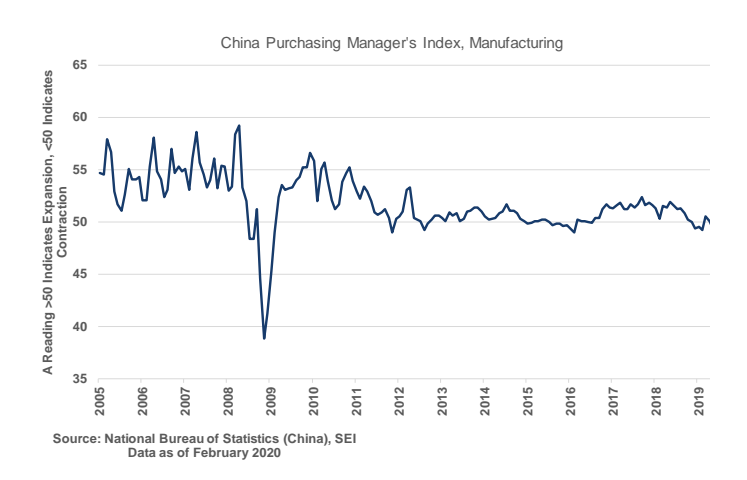
Exhibit 2: China's economy was hit hard by the virus in February. Other countries will likely show weakness in March and April.

Day one represents the first day each country exceeded 500 COVID-19 Cases. China (1/22/20), Italy (2/24/20), South Korea (2/27/20), U.S. (3/8/20) and Spain (3/7/20).