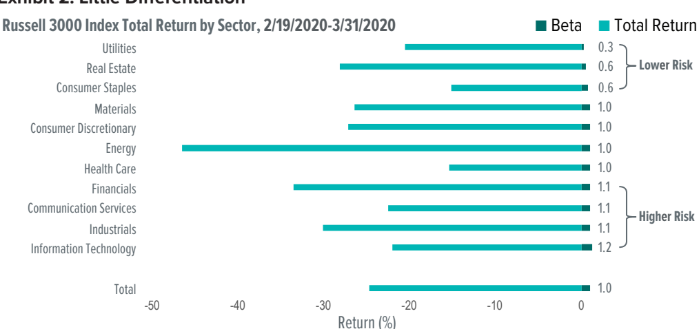
Exhibit 2: Little Differentiation

The speed and magnitude of the coronavirus outbreak hit equity markets in an unprecedented way. Between the Russell 3000 Index peak on February 19, 2020 and March 31, 2020, there was surprisingly little difference in returns between those sectors perceived as lower-risk and those perceived as higher-risk before the crisis (Exhibit 2).