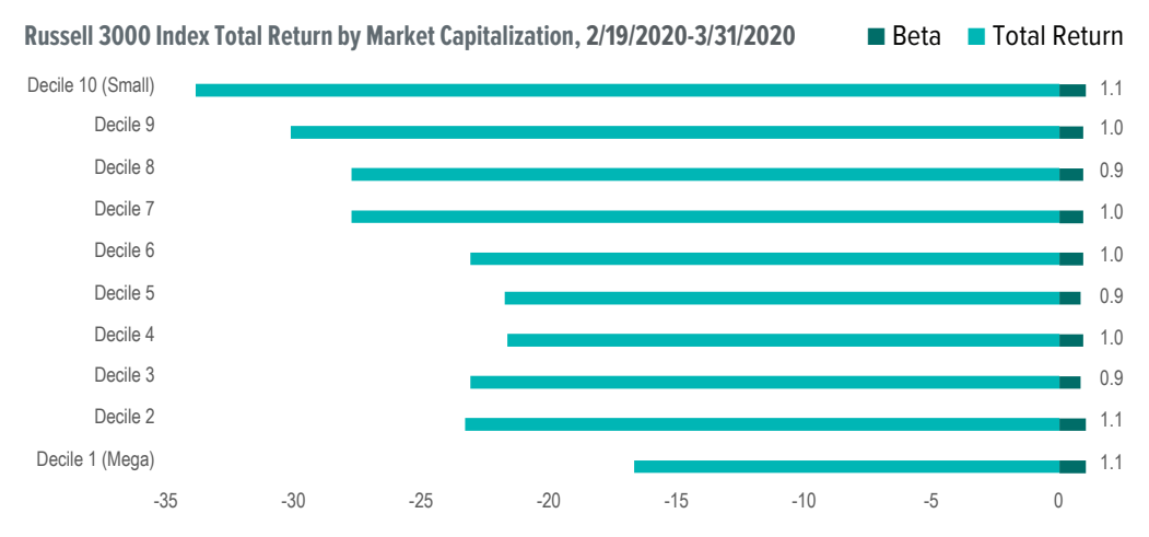
Exhibit 3: Liquidity Demands Punished Small Size

Data as of 3/31/2020. Index returns are for illustrative purposes only and do not represent actual investment performance. Index returns do not reflect any management fees, transaction costs or expenses. Indexes are unmanaged and one cannot invest directly in an index. Past performance does not guarantee future results.