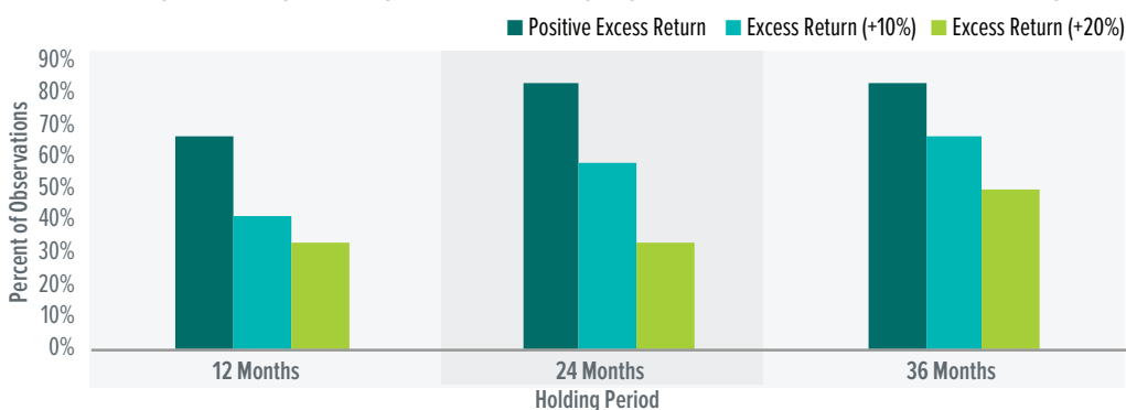
Exhibit 2: High Batting Average for Value Buying Three Months Before the Trough

1/1/1926 – 3/31/2020. Cumulative excess return of Ken French value factor (cheapest 30% of stocks by price-to-book value) versus S&P 500 Index (prior to 5/1/57 returns of the S&P 90 Index were used).